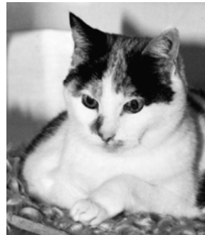
Above is Cheeky, who was lucky enough to find a new and loving home through CATFLAP

You can find more information about these, and other upcoming events, in our newsletters or on our website at www.catflapcharity.co.uk